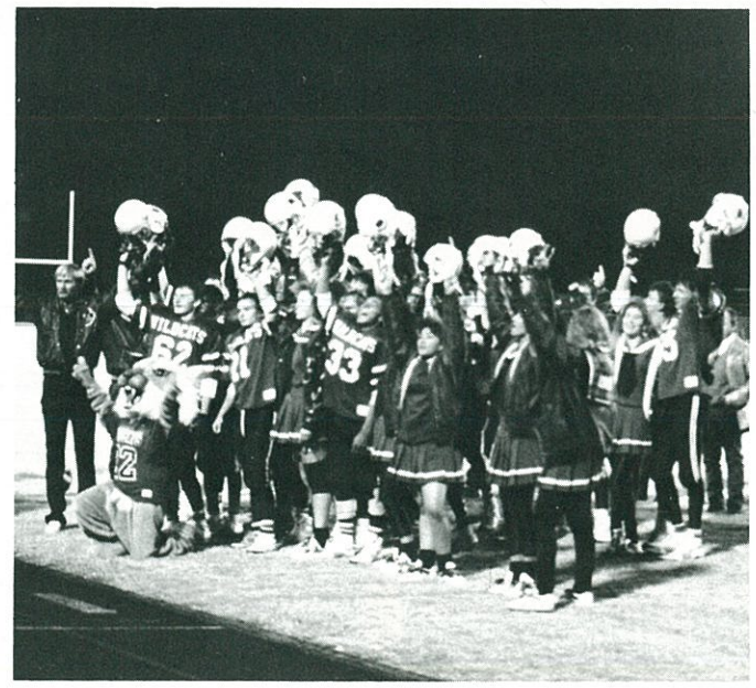
True wildcats show their true spirit.