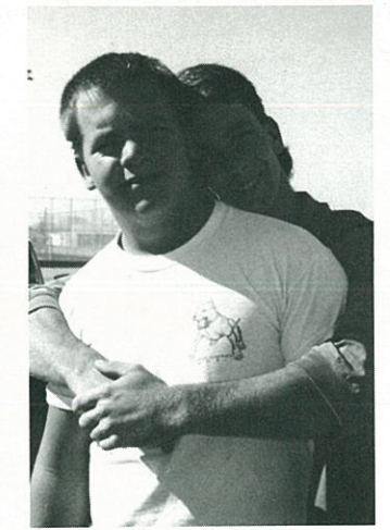
Students show their spirit on sock day.