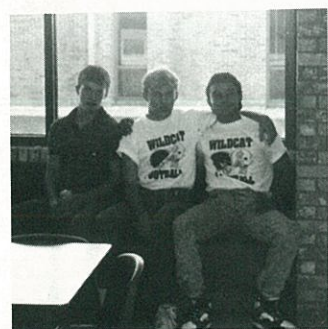
Are we cool or what?