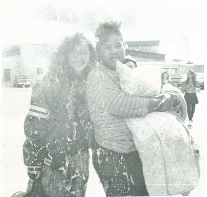
Mommy doesn't love us any more.

When students are not together at games, they are together as friends and as families. Friends are always together when someone has lost a loved one in their family. "One Big Family," that is what Wink students are all about.