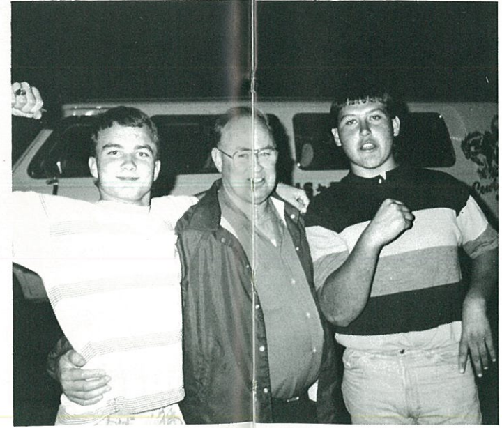
The three stooges: Larry, Curly, and Moe.